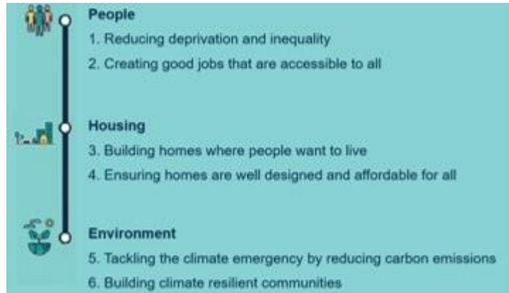
Figure 1: Place Narrative Cross-Cutting Challenges

3.3 The challenges confirm that despite a thriving economy in parts of the region, not all of our communities feel the benefits of that growth. Increasing polarisation between communities and tackling the climate emergency requires action across all parts of the economy and infrastructure delivery.